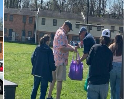
Family Walk through Holy Week