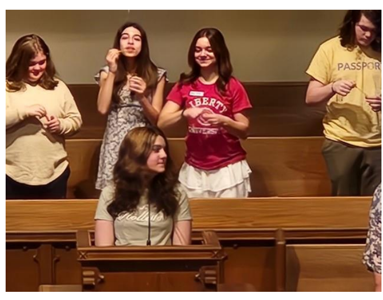
Worshipping with bubbles...